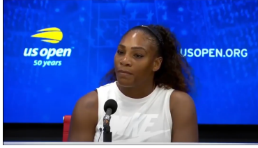
Fig. 2: One example of an interview in the CID dataset. The individual being interviewed displays discomfort according to our three human reviewers. Her face and upper torso are clearly visible to the camera for about 30 seconds.