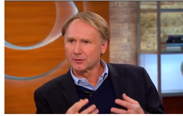
Fig. 3: A second example of an interview in the CID dataset. The individual being interviewed displays comfort according to our three human reviewers. His face and upper torso are clearly visible to the camera for about 30 seconds.

Equation 1 shows the formula for calculating the comfort score from the rules listed above. The coefficients are determined experimentally. We run our data points through our rule-based system which provides a binary classification of true (for comfortable) or false (for uncomfortable). Each of these rules modifies a score. The range of this score is -0.4 to 0.4 . If the threshold is passed for each of these rules then their weight is added to the score. If this score is negative, then the individual is classified as uncomfortable, and if it is non-negative, then the classification is comfortable.