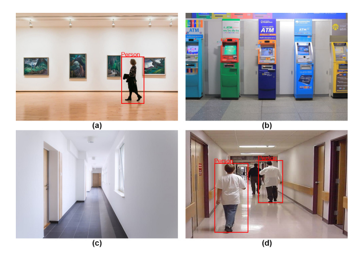
Fig. 3. Sample of results on images of three categories: an art gallery, hallway, and the vending machine. To illustrate the importance of human presence, consider images (c) and (d) both are hallway context; however, one of the images is just a hallway without any people; in this case, the general rule of stay on the right side is applicable.

Evaluation: Several criteria can be used to analyze semantic measures. Some can be studied theoretically, while others require empirical analyses. Among the criteria that are the most frequently considered evaluating semantic measures, we use the accuracy and precision of executed rules, mathematical properties and semantics, and characterization regarding technical details.